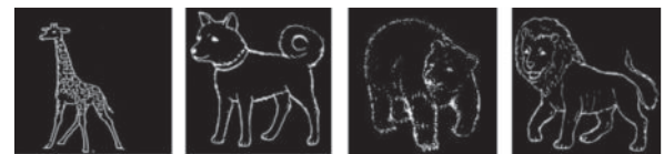
From the right, giraffe, dog, bear, and lion